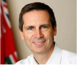
Dalton McGuinty, Premier of Ontario (invited)

Dalton McGuinty is Ontario's 24th Premier. In the provincial election of 2003, he led the Liberal party to a majority government. He and his party earned a second consecutive majority on October 10, 2007. He has represented the riding of Ottawa South as its MPP since 1990.